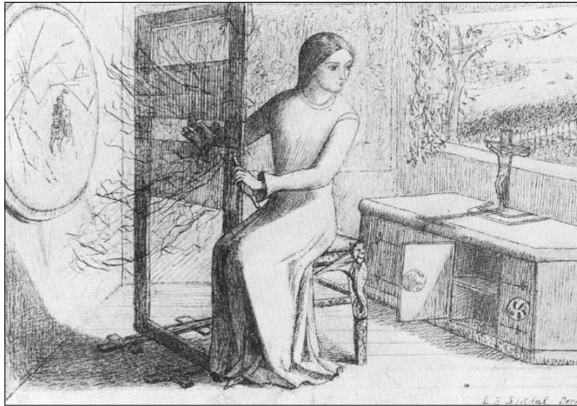
Figure 2: The Lady of Shalott by Elizabeth Siddal.

Source: Siddal, Elizabeth. The Lady of Shalott . 1853, LizzieSiddal.com , http://lizziesiddal.com/portal/tennyson-the-lady-of-shalott/ .